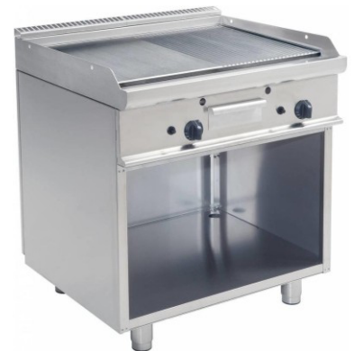
COUNTY GRILL SIZE : CUSTOMIZED (DIE-115)