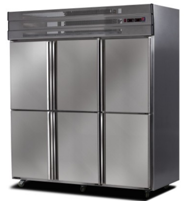
VERTICAL SIX DOOR SIZE : CUSTOMIZED (DIE-142) CAPACITY : 1800 Ltr.