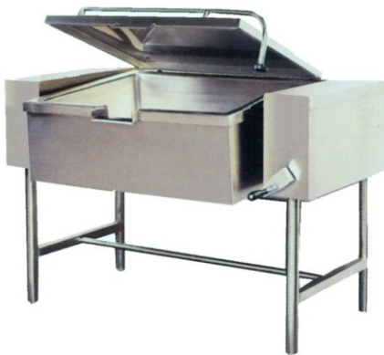
TILTING BRAZING PAN SIZE : CUSTOMIZED (DIE-110) CAPACITY : 52 TO 200 Ltr.