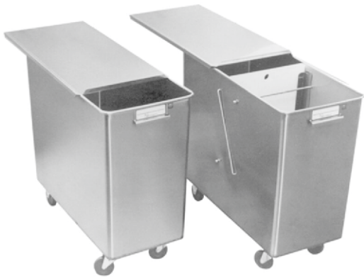
ATTA / MAIDA BIN SIZE : CUSTOMIZED (DIE-173)