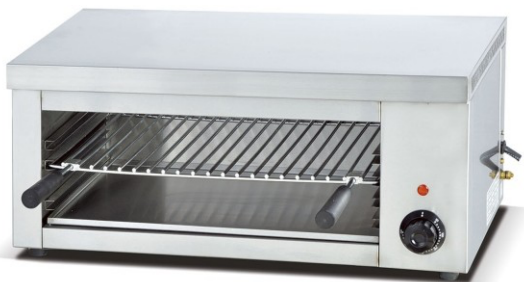
SALAMANDER SIZE : CUSTOMIZED (DIE-157)