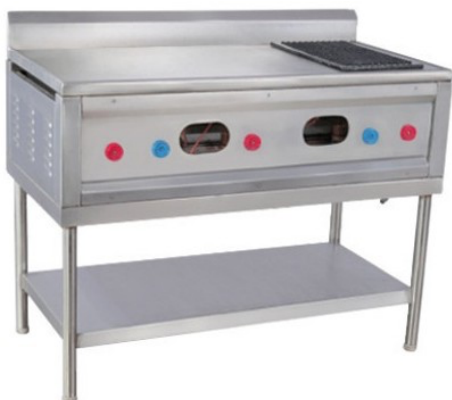
CHAPATI PLATE WITH PUFFER SIZE : CUSTOMIZED (DIE-107)