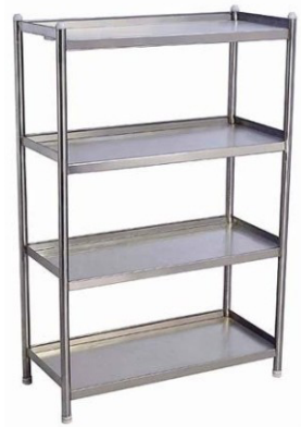
STORAGE / CLEAN DISH RACK SIZE : CUSTOMIZED (DIE-175)