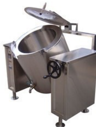
BULK COOKER SIZE : CUSTOMIZED (DIE-108) CAPACITY : 50 TO 200 Ltr.