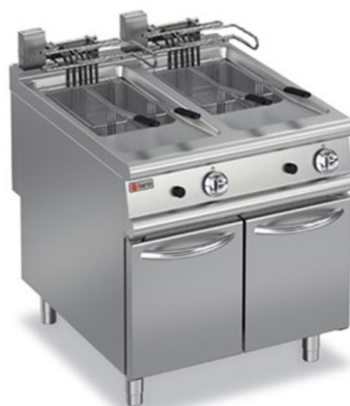
DEEP FAT FRYER (GAS/ELECTRIC) SIZE : CUSTOMIZED (DIE-114) CAPACITY : 8 TO 20 Ltr.