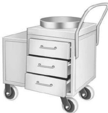
TEA SERVICE TROLLEY SIZE : CUSTOMIZED (DIE-168)