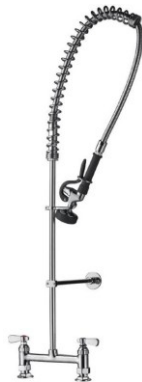
PRE RINSE (DIE-132) IMPORTED/BRAUNED