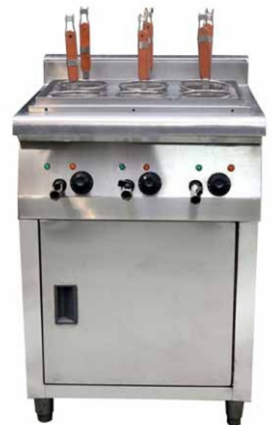
PASTA COOKER SIZE : CUSTOMIZED (DIE-106)