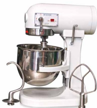
SPIRAL MIXER IMP/IND (DIE-192) CAPACITY : 5 TO 80 Ltr.