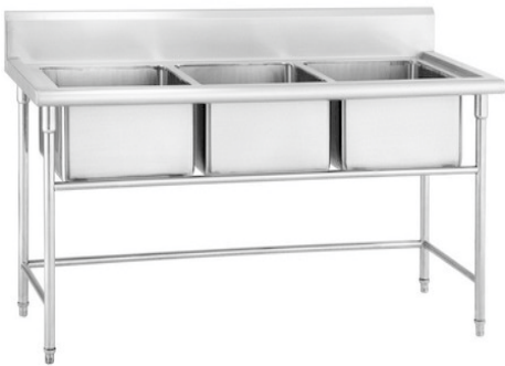
THREE SINK DISH WASH UNIT SIZE : CUSTOMIZED (DIE-128)