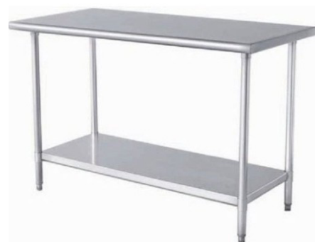
CHAPATI COLLECTION TABLE SIZE : CUSTOMIZED (DIE-188)