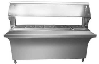
BAIN MARIE FRONT GLASS & TRAY SLIDE SIZE : CUSTOMIZED (DIE-166)