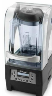
THE QUIET BLANDER