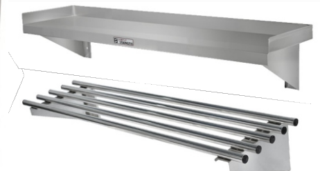
WALL SHELF SIZE : CUSTOMIZED (DIE-178)