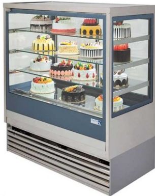
BAKERY/SWEETS DISPLAY COUNTER SIZE : CUSTOMIZED (DIE-148)