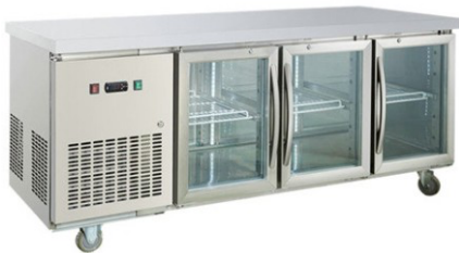
GLASS (DOOR UNDER COUNTER) SIZE : CUSTOMIZED (DIE-140)