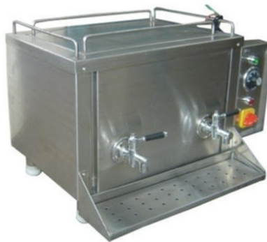
TEA MILK DISPENSER SIZE : CUSTOMIZED (DIE-158)