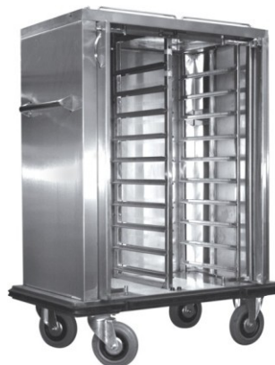
HOT FOOD SERVICE TROLLEY SIZE : CUSTOMIZED (DIE-171)