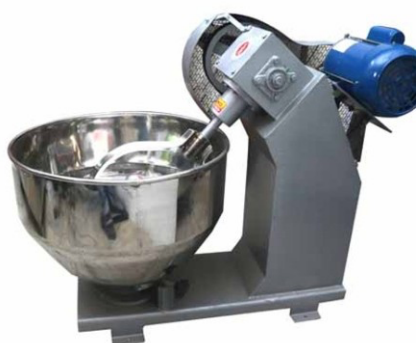
DOUGH KNEADER (ELECTRIC) (DIE-184) CAPACITY : 5 TO 100 Ltr.