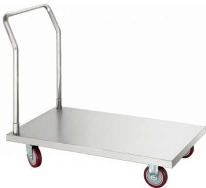
SS PLATFORM TROLLEY SIZE : CUSTOMIZED (DIE-176)