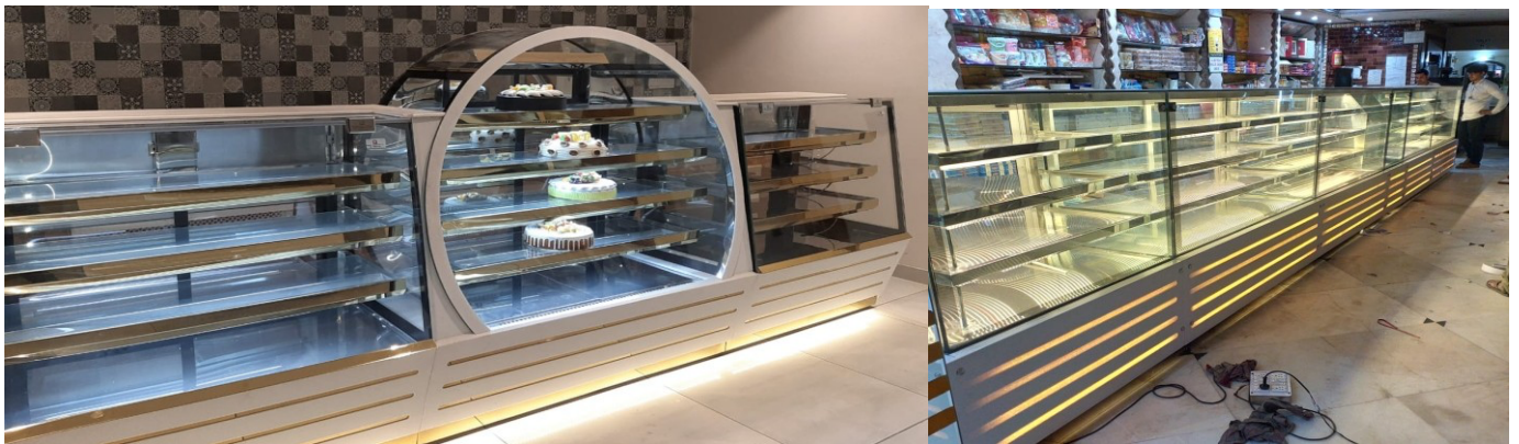
BAKERY / SWEETS DISPLAY COUNTER SIZE CUSTOMIZED (DIE-153)