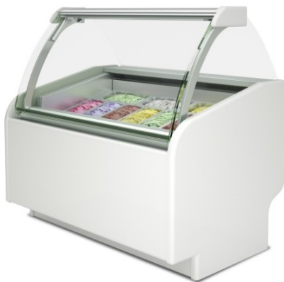
ICE CREAM PARLOR SIZE : CUSTOMIZED (DIE-150)