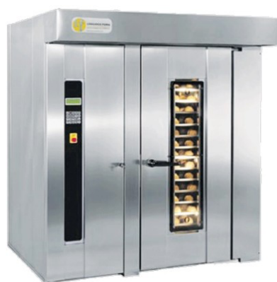
ROTARY OVEN (GAS/ELECTRIC) SIZE : CUSTOMIZED (DIE-193)