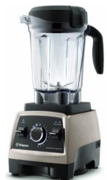
2 SPEED BLANDER