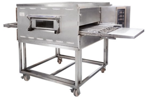
CONVEYOR PIZZA OVEN ELECTRIC/GAS (DIE-156) INDIAN/IMPORTED