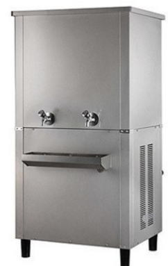
WATER COOLER (DIE-172) CAPACITY : 25 TO 1000 Ltr.