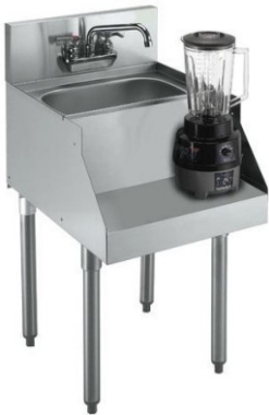
BLANDER STATION WITH SINK SIZE : CUSTOMIZED (DIE-198)