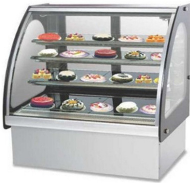
BAKERY/SWEETS DISPLAY COUNTER SIZE : CUSTOMIZED (DIE-147)