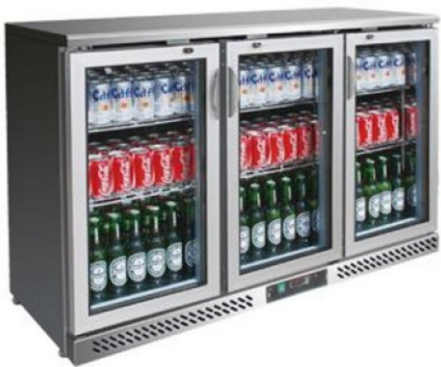
THREE DOOR BACK BAR CHILLER (DIE-201) SIZE : STANDARD (IMPORTED)