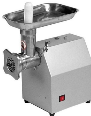
MEAT MINCER (DIE-126) CAPACITY : 20 TO 150 Kg./Hr.