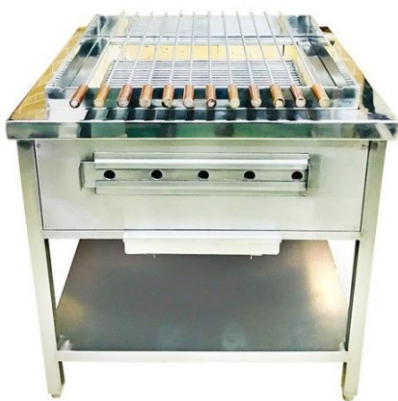
CHARCOAL GRILL (GAS/ELECTRIC) SIZE : CUSTOMIZED (DIE-113)