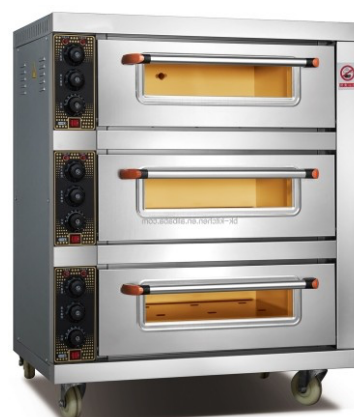
THREE DECK BAKING OVEN GAS/ELECTRIC (IMP/IND) SIZE : CUSTOMIZED (DIE-194)