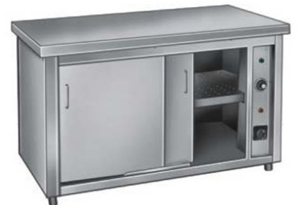
HOT FOOD PICKUP COUNTER SIZE : CUSTOMIZED (DIE-169)