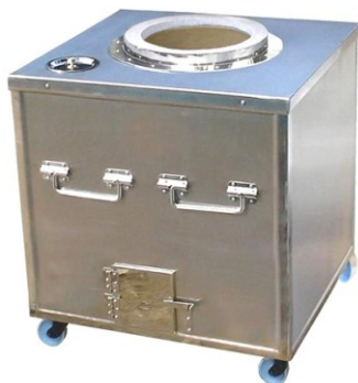
SS MOBILE TANDOOR SIZE : CUSTOMIZED (DIE-116)