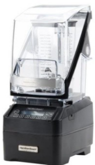
COMMERCIAL SUMMIT BLANDER