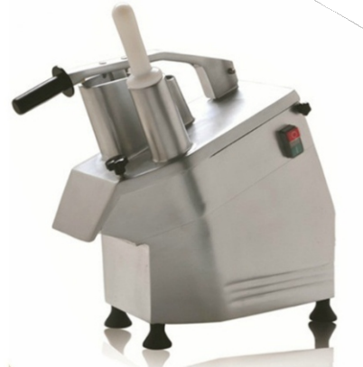
VEGETABLE CUTTING MACHINE (ELECTRIC) (DIE-123) CAPACITY : 40 TO 200 Kg./Hr.