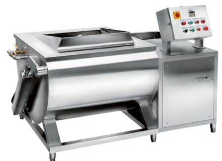
VEGETABLE WASHER SIZE : CUSTOMIZED (DIE-127) CAPACITY : 40 TO 80 Kg.