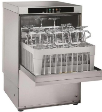
GLASS WASHER SIZE : CUSTOMIZED (DIE-199)