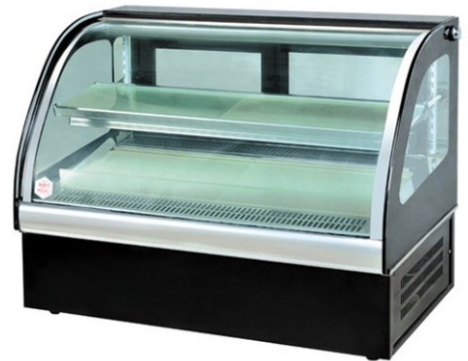
TABLE TOP BAKERY/SWEETS DISPLAY COUNTER SIZE : CUSTOMIZED (DIE-149)