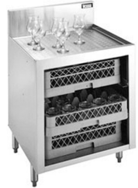
GLASS RACK COUNTER SIZE : CUSTOMIZED (DIE-200)