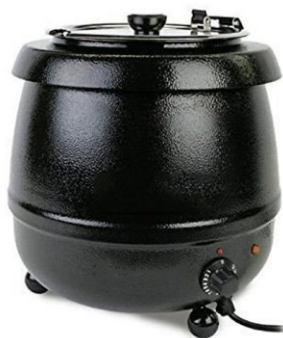
SOUP KETTLE STANDARD/BRANDED (DIE-161) CAPACITY : 7 TO 15 Ltr.