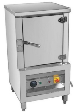
IDLI STEAMER (GAS/ELECTRIC) SIZE : CUSTOMIZED (DIE-112) CAPACITY : 36 TO 250 Idli.