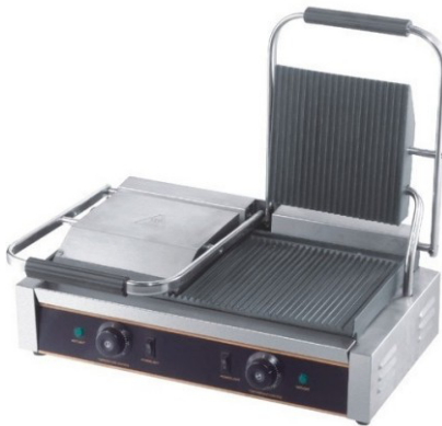
SANDWICH GRILER (ELECTRIC) SINGLE / DOBLE (DIE-155) (STD/JAMBO)