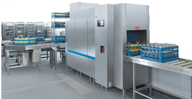
RACK CONVEYOR DISH WASHER (DIE-135) CAPACITY : 100 TO 180 RACK/HOUR