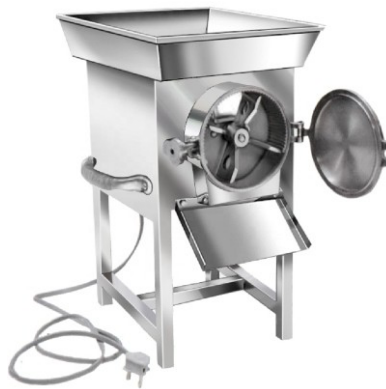
PULVERIZER (ELECTRIC) (DIE-120) CAPACITY : 2/3/5/ HP.