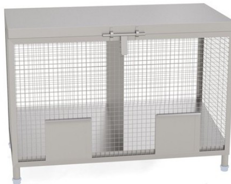
ONION / POTATO BIN SIZE : CUSTOMIZED (DIE-177)