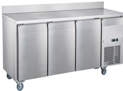
THREE DOOR UNDER COUNTER REFRIGERATOR/ FREEZER SIZE : CUSTOMIZED (DIE-138)