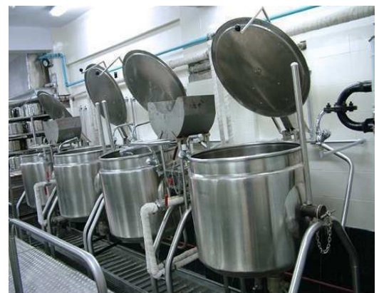
STEM COOKING VESSELS WITH STEAM GENERATOR (GAS OPERATOR) SIZE : CUSTOMIZED (DIE-118)