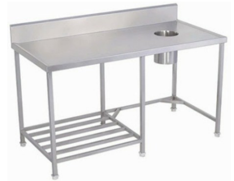
DIRTY DISH LANDING TABLE SIZE : CUSTOMIZED (DIE-130)