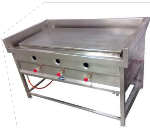
DOSA PLATE SIZE : CUSTOMIZED (DIE-104)