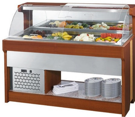
SALAD COUNTER SIZE : CUSTOMIZED (DIE-151)