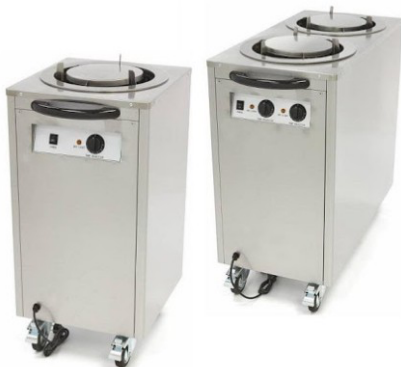
PLATE WARMER (ELECTRIC) SINGLE / DOUBLE (DIE-170) CAPACITY : 50 TO 100 PLATES