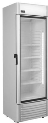
VISI COOLER (DIE-144) CAPACITY : 300 TO 500 Ltr.