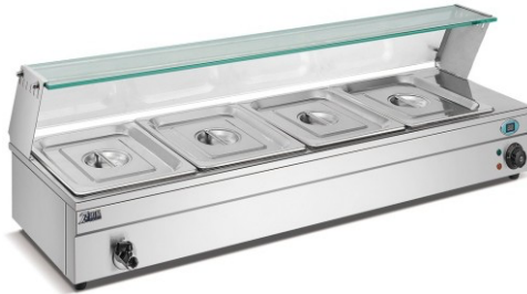
TABLE TOP BAIN MARIE SIZE : CUSTOMIZED (DIE-165)