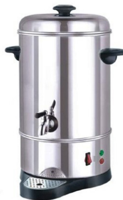
WATER/MILK BOILER CUSTOMISED / IMPORTED CAPACITY : 10 TO 40 Ltr. (DIE-162)