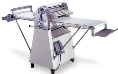
DAUGH SHEETER ELECTRIC (IMP/IND) SIZE : CUSTOMIZED (DIE-195)