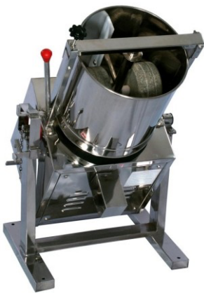
TILTING WET GRINDER (ELECTRIC) (DIE-122)