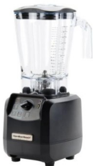
2 SPEED BLANDER