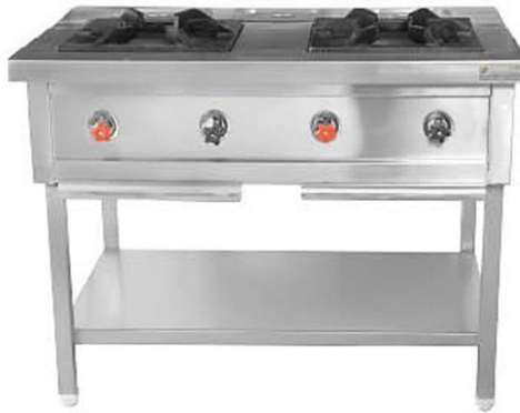
TWO BURNER RANGE SIZE: CUSTOMIZED (DIE-102)