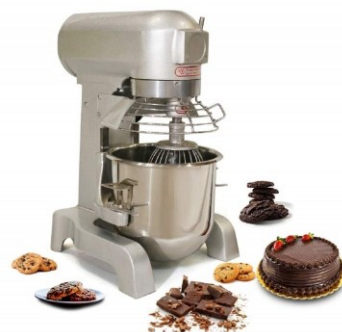
PLANETARY MIXER (IMP/IND) CAPACITY : 5 TO 80 Ltr. (DIE-191)