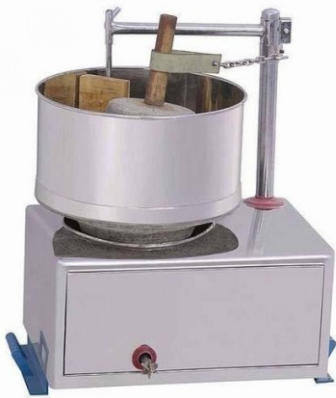
WET MASALA GRINDER (ELECTRIC) (DIE-119) CAPACITY : 5 TO 25 Ltr.