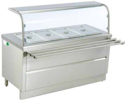
BAIN MARIE (HOT/COLD) FRONT GLASS & TRAY SLIDE SIZE : CUSTOMIZED (DIE-164)