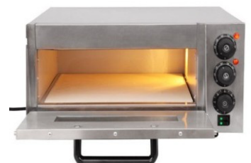
PIZZA OVEN CUSTOMISED / IMPORTED ELECTRIC/GAS (DIE-163)