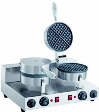
WAFFLE MAKER SINGLE/ DOUBLE (DIE-160) IMPORTED