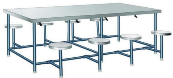
DINNING TABLE WITH SEATER SIZE : CUSTOMIZED (DIE-180)