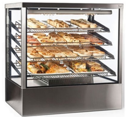
HOT DISPLAY COUNTER SIZE : CUSTOMIZED (DIE-152)