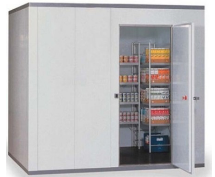
WALK IN CHILLER WALK IN FREEZER SIZE : CUSTOMIZED (DIE-146)