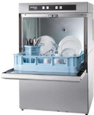
UNDER COUNTER DISHWASHER (DIE-131) STD/IMPORTED