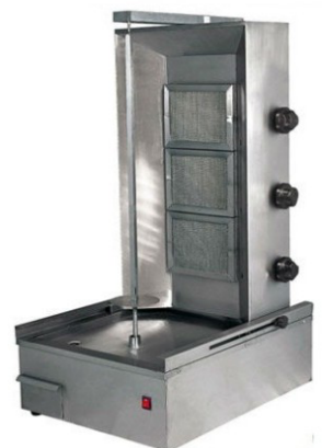
SHAWARMA GRILL (ELECTRIC/GAS) SIZE : 2 TO 4 BURNER (DIE-109)