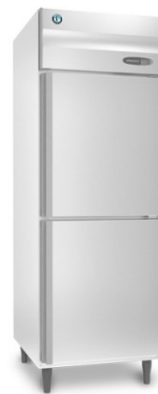
VERTICAL TWO DOOR (DIE-145) CAPACITY : 400 TO 600 Ltr.