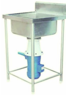
GARBAGE CRUSHER (DIE-133) CAPACITY : 1 TO 5 HP.