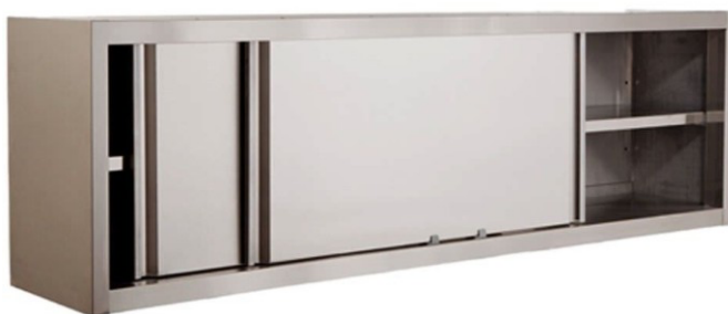
WALL MOUNTED CABINET SIZE : CUSTOMIZED (DIE-179)