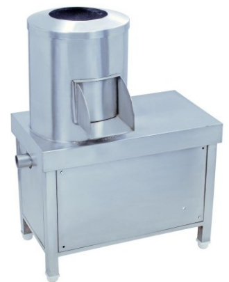
POTATO PEELER (ELECTRIC) (DIE-124) CAPACITY : 5 TO 50 Kg.