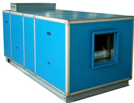
FRESH AIR CENTRIFUGAL BLOWER UNIT CAPACITY : 3 TO 15 HP. (DIE-186)