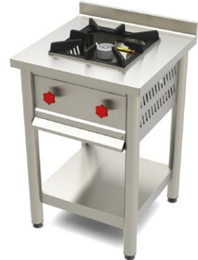
SINGLE BURNER RANGE SIZE: CUSTOMIZED (DIE-103)