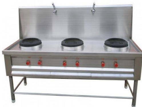
THREE BURNER CHINESE RANGE SIZE : CUSTOMIZED (DIE-105)