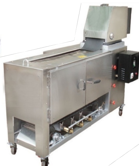
CHAPATI MAKING MACHINE (DIE-186) CAPACITY : 800 TO 1000 CHAPATI/Hr.