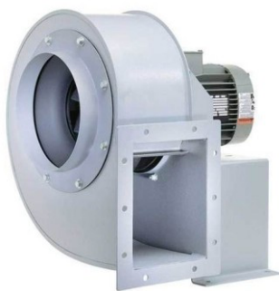
CENTRIFUGAL EXHAUST BLOWER (DIE-182) CAPACITY : 5 TO 15 HP.