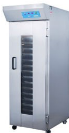
PROOFING CHEMBER SIZE : CUSTOMIZED (DIE-196) SIZE : CUSTOMIZED