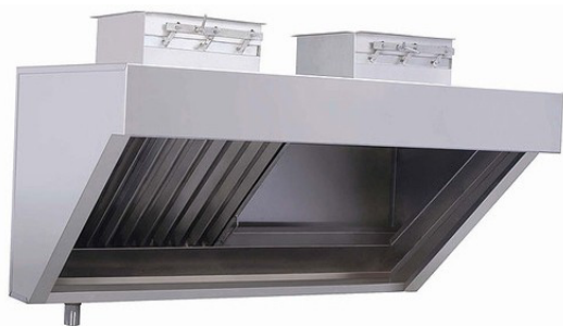
EXHAUST HOOD SIZE : CUSTOMIZED (DIE-181)