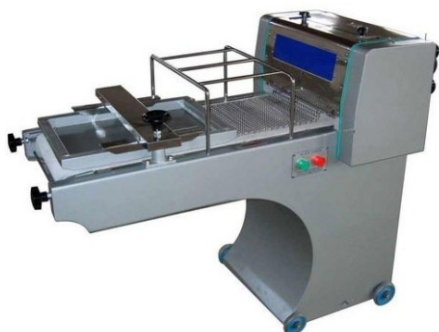
DOUGH MOULDER IND/IMP SIZE : CUSTOMIZED (DIE-189)