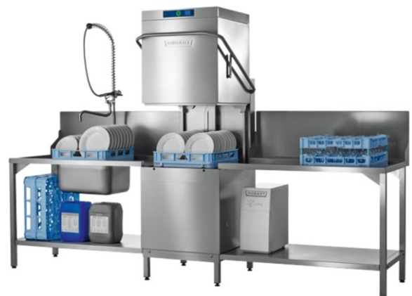
HOOD TYPE DISHWASHER (DIE-136) CAPACITY : 22 TO 60 RACK/HOUR