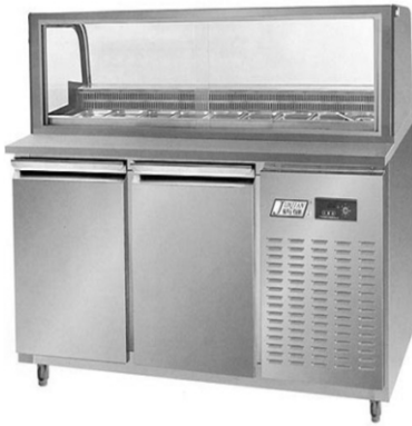
TWO DOOR UNDER COUNTER (PIZZA MAKELINE) REFRIGERATOR/ FREEZER SIZE : CUSTOMIZED (DIE-137)