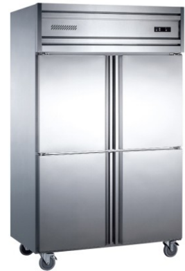
VERTICAL FOUR DOOR REFRIGERATOR/ FREEZER SIZE : CUSTOMIZED (DIE-139)