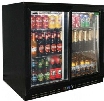
TWO DOOR BACK BAR CHILLER (DIE-202) SIZE : STANDARD (IMPORTED)