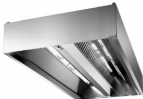
ISLAND EXHAUST HOOD SIZE : CUSTOMIZED (DIE-183)