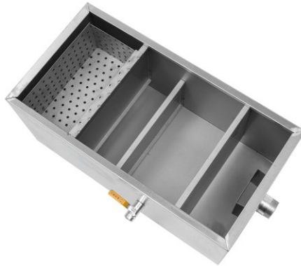
GREASE TRAP SIZE : CUSTOMIZED (DIE-129)