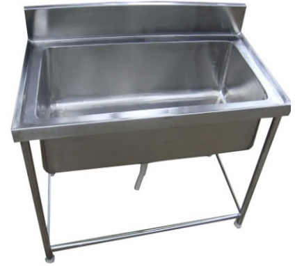
POT WASH UNIT SIZE : CUSTOMIZED (DIE-134)