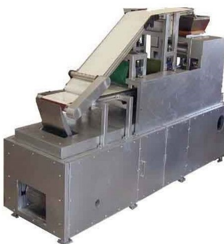
FULLY AUTOMATIC CHAPATI MACHINE (DIE-185) CAPACITY : 1000 TO 4000 CHAPATI/Hr.