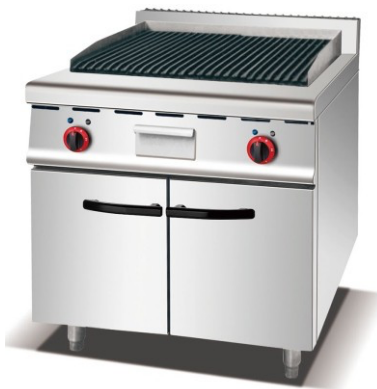
LAVA GRILL (GAS/ELECTRIC) SIZE : CUSTOMIZED (DIE-111)