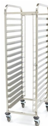
TRAY RACK TROLLEY SIZE : CUSTOMIZED (DIE-197)