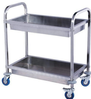
CHAPATI COLLECTION TROLLEY SIZE : CUSTOMIZED (DIE-187)