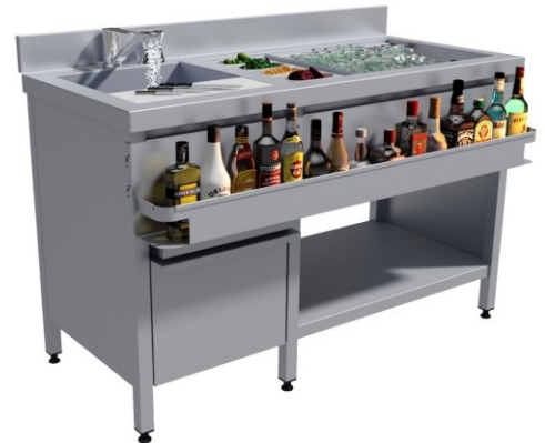
COCKTAIL STATION SIZE : CUSTOMIZED (DIE-203)