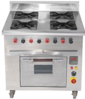
FOUR BURNER RANGE WITH OVEN SIZE : CUSTOMIZED (DIE-101)