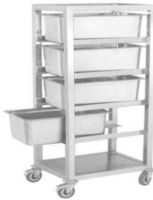
GN PAN TROLLEY SIZE : CUSTOMIZED (DIE-174)