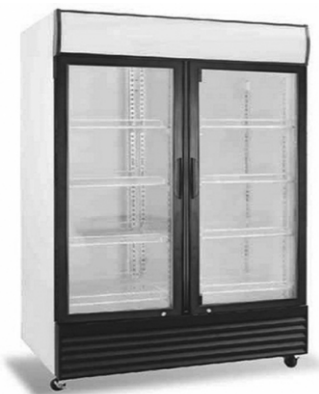
VERTICAL GLASS DOOR (DIE-143) CAPACITY : 400 TO 600 Ltr.