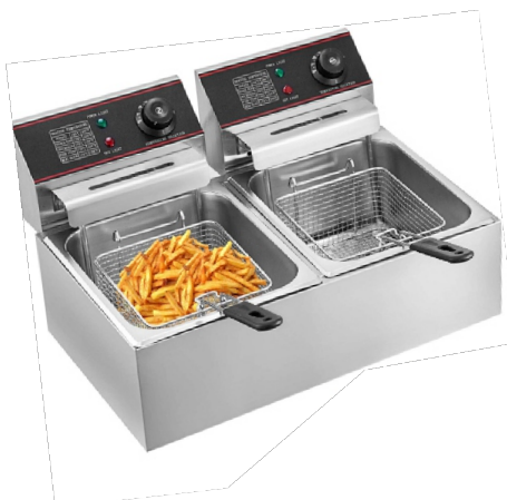
DEEP FAT FRYER (TABLE TOP) SIZE : CUSTOMIZED (DIE-117) CAPACITY : 4 TO 18 Ltr.