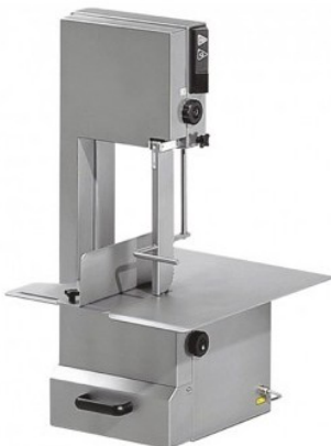
BONESAW (ELECTRIC) (DIE-125) BLADE : 16/20 mm