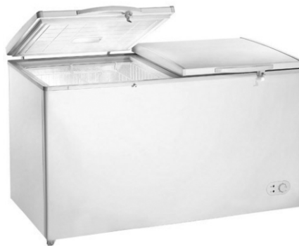
CHEST FREEZER (DIE-141) CAPACITY : 100 TO 1000 Ltr.