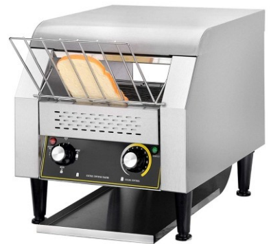
CONVEYOR TOASTER (ELECTRIC) SIZE : CUSTOMIZED (DIE-159)