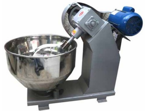
DOUGH KNEADER (ELECTRIC) (DIE-121) CAPACITY : 5 TO 100 Ltr.