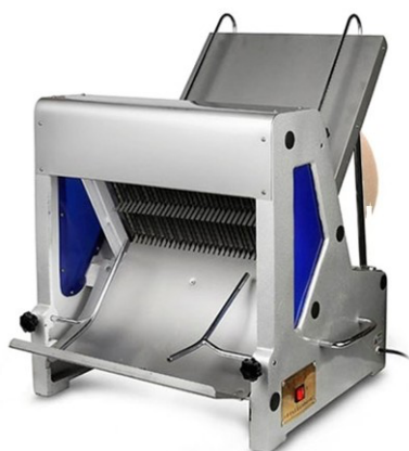
BREAD SLICER (ELECTRIC) TABLE/TOP/ FLOOR MODEL SIZE : CUSTOMIZED (DIE-190)