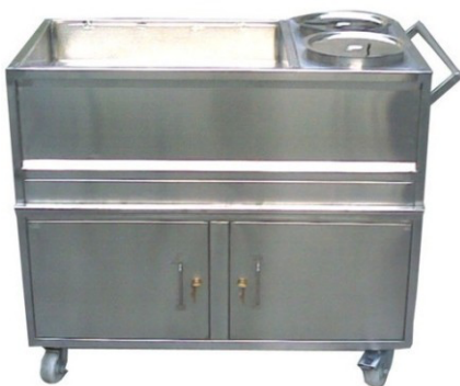
HOT FOOD SERVICE TROLLEY SIZE : CUSTOMIZED (DIE-167)